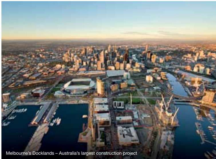
Melbourne's Docklands – Australia's largest construction project