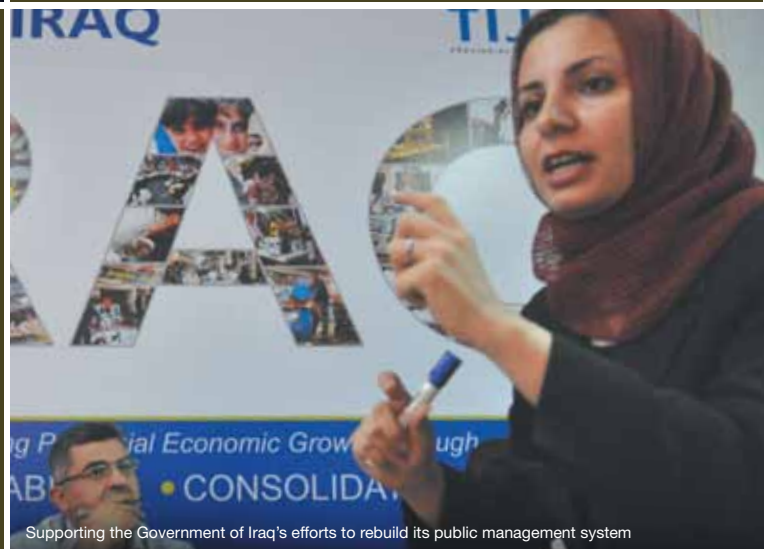
Supporting the Government of Iraq's efforts to rebuild its public management system

Visit coffey.com today and find out more about our specialist services